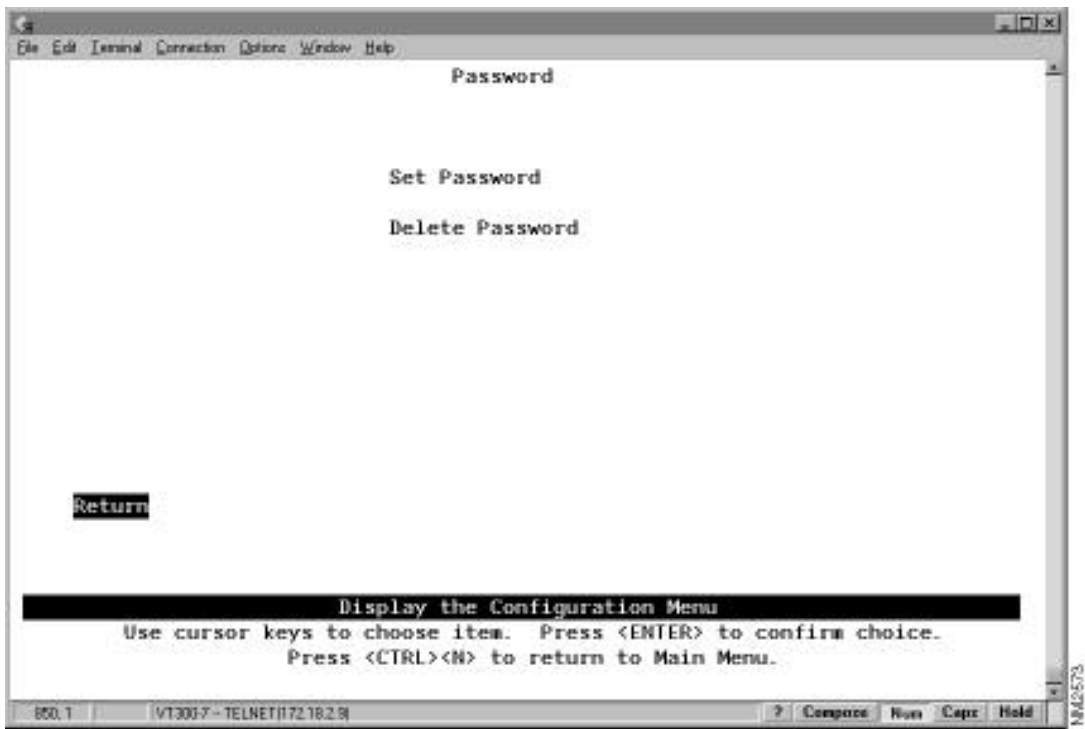
Figure 6-1 Password Panel