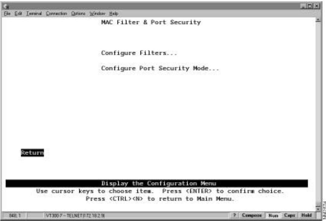
Figure 6-2 MAC Filter & Port Security Panel

To limit the scope and access of users on segments attached to the Catalyst 2600, select MAC Filter & Port Security from the Configuration Menu. The MAC Filter & Port Security panel (Figure 6-2) is displayed.