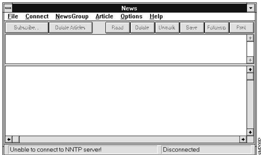
Figure 7-1 News Window

Step 2 Select News Reader Setup from the Options menu.